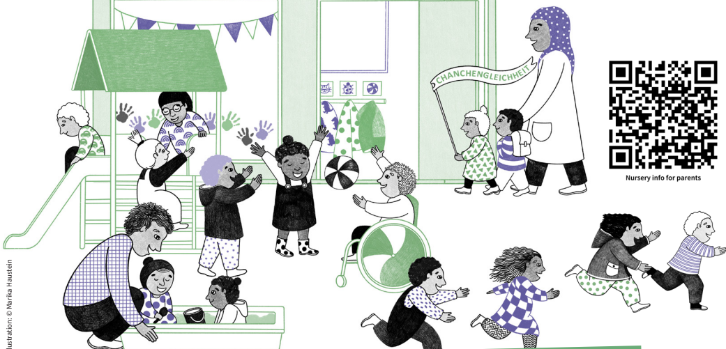
Illustration: © Marika Hausten