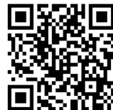
Simply explained: The nursery voucher